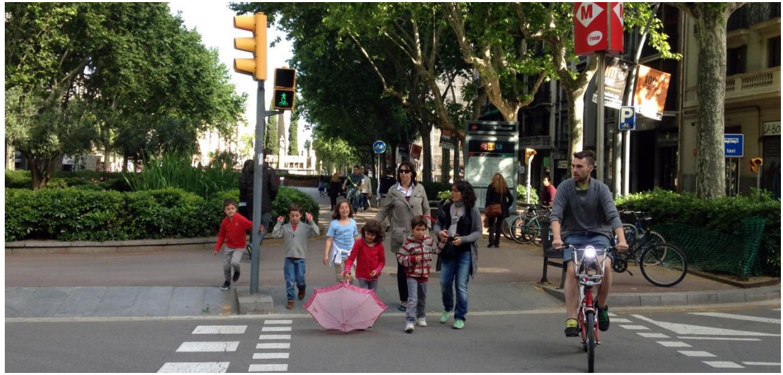
Towards Livable Cities- The Role of Urban Mobility Training course, Parallel to Habitat III Quito, October 20, 2016